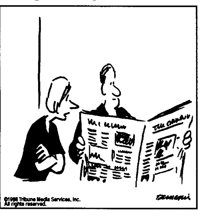
"Check the polls and see what we think."