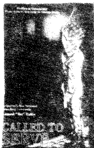
CALLED TO SERVE By James "Bo" Gritz $24.95...Book

In his book, Gritz lifts the veil of National Security to reveal how U. S. Forces have been used as tools by international elitists who are guilty of drug trafficking, preventing American POW's from coming home, and more.